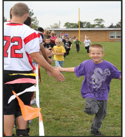
Firelands High School students cheer on elementary students as they run laps at the Falcons on the Fly Kick-Off Event September 14th. Falcons on the Fly is a walking/running program that takes place at Firelands Elementary during recess. Thanks to the FES PTG for making this program possible!