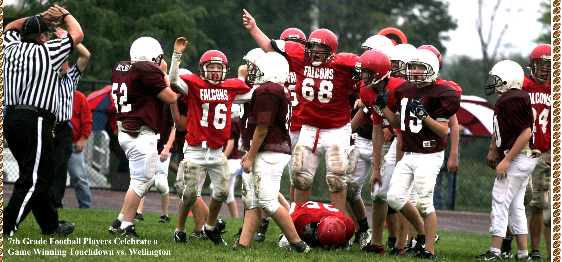
7th Grade Football Players Celebrate a Game Winning Touchdown vs. Wellington